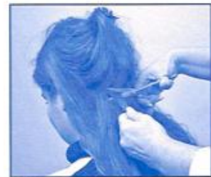
A. Holding the hair up and cutting a sample.

2. CUT HAIR FROM ANYWHERE ON THE HEAD, AND AS CLOSE TO THE SCALP AS POSSIBLE. It matters little where on the head you cut it. The way to avoid bald spots is to cut several small samples and combine them. If you cannot use head hair, the second best is beard hair for men. You can also use pubic hair, but it is not quite as accurate.