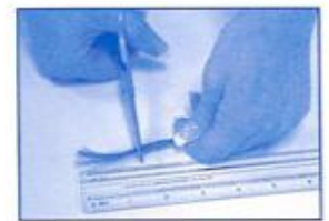
B. Cutting root end off for sample of long hair.

3. SET EACH SAMPLE DOWN ON A DESK OR TABLE. MEASURE ABOUT 1 INCH, OR 2 CENTIMETERS FROM THE CUT END NEAR THE SCALP. CUT OFF AND DISCARD ANY HAIR THAT IS MORE THAN ABOUT 1 INCH, OR ABOUT 2 CENTIMETERS LONG FROM THE SCALP END. Shorter hair is excellent, and the shorter the better, in fact. AVOID SENDING HAIR THAT IS LONGER THAN 1 TO 1.5 INCHES LONG. Also do not send hair cut from the ends of long hair.